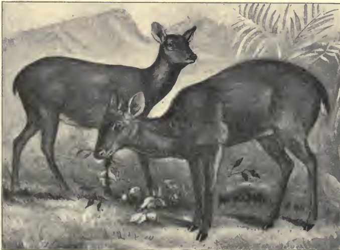
FIG. IX. HIPPOCAMELUS SARTORI. SARTORI'S BROCKET.